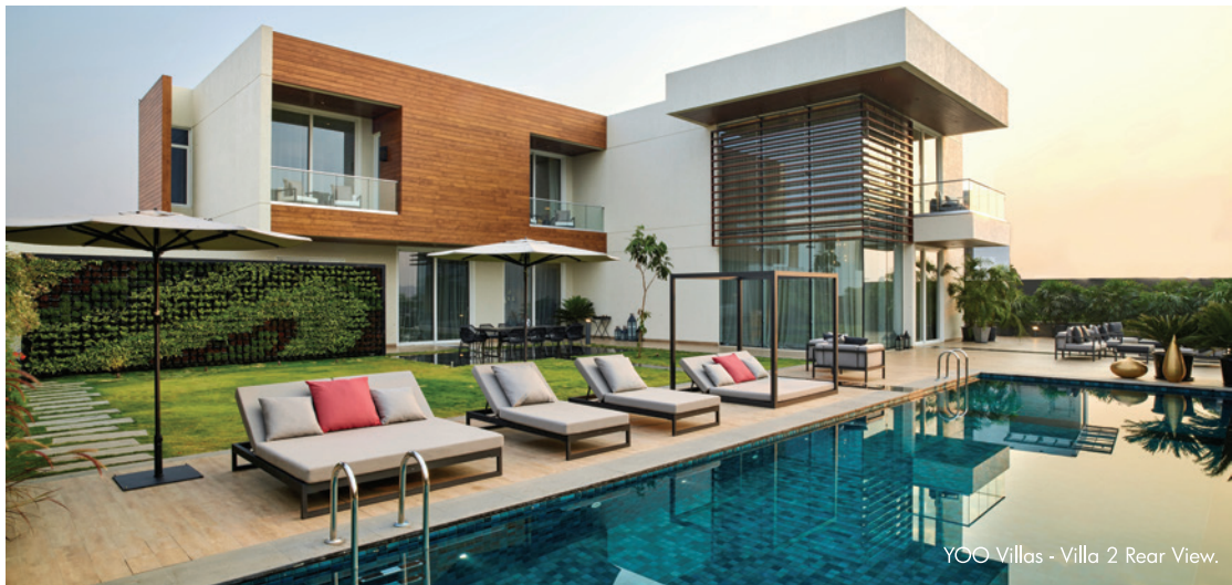
YOO Villas - Villa 2 Rear View.