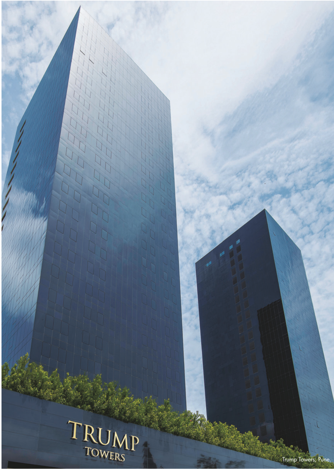
Trump Towers, Pune.