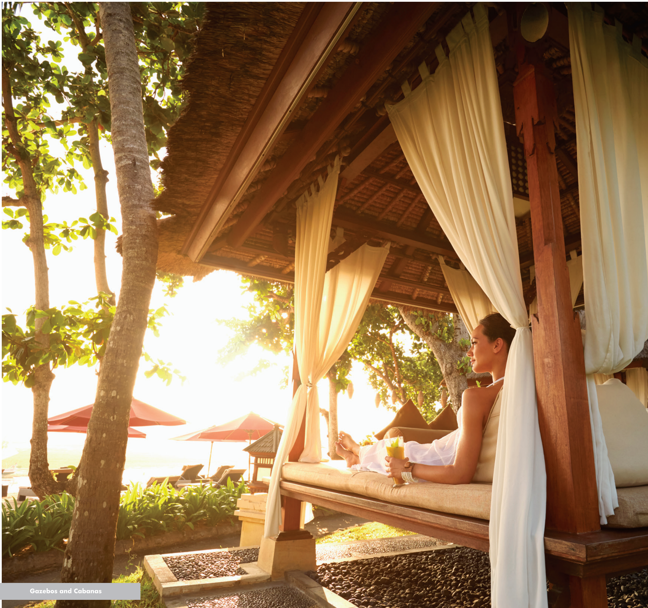
Gazebos and Cabanas