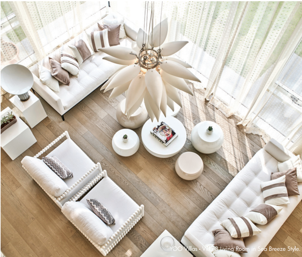
YOO Villas - Villa 3 Living Room in Sea Breeze Style.