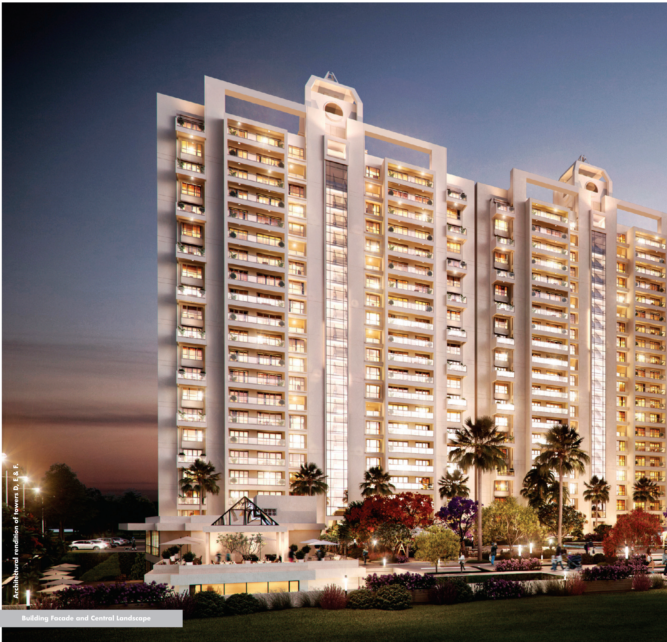
Architectural rendition of towers D, E & F.