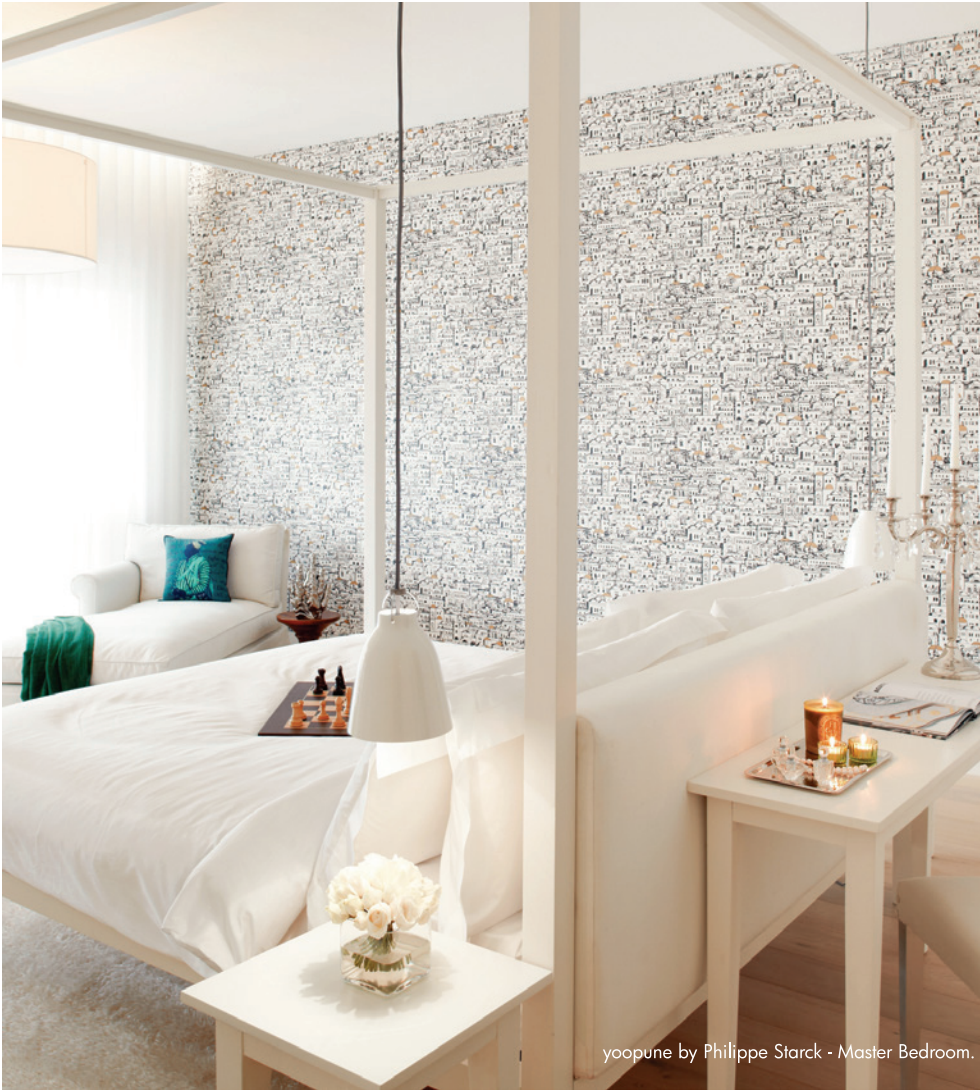
yooPune by Philippe Starck - Master Bedroom.