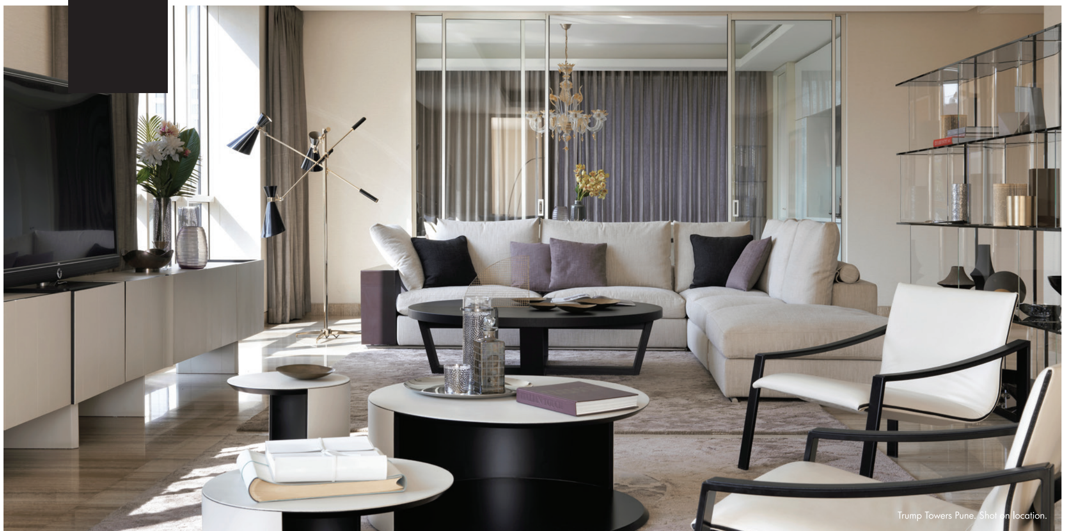
Trump Towers Pune. Shot on location.