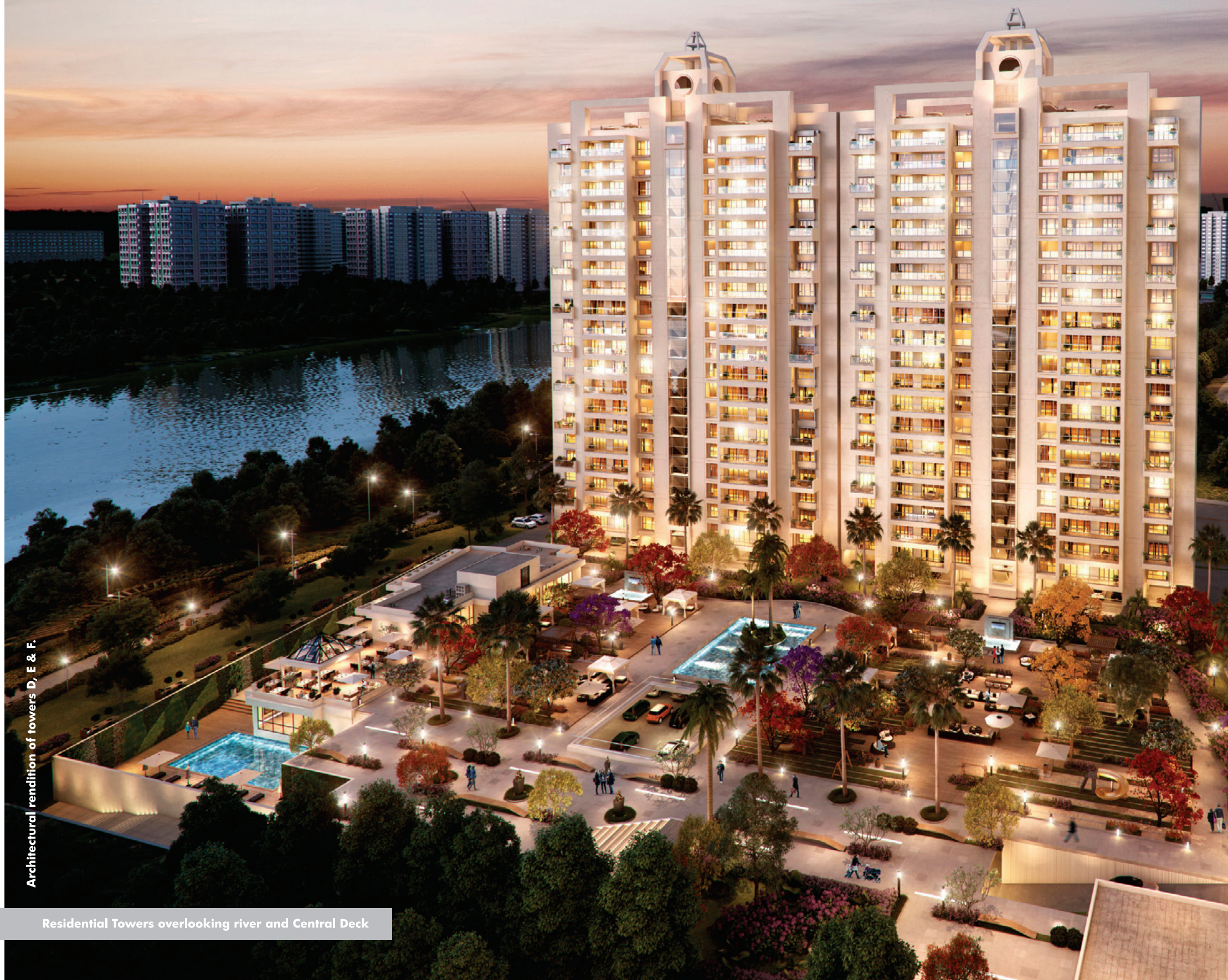
Residential Towers overlooking river and Central Deck